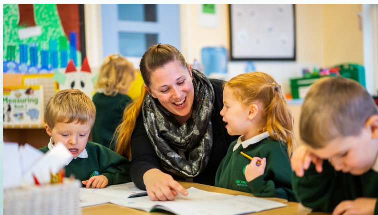
Individual support is provided by skilled Learning Assistants

Where this occurs, priority will be given as follows: