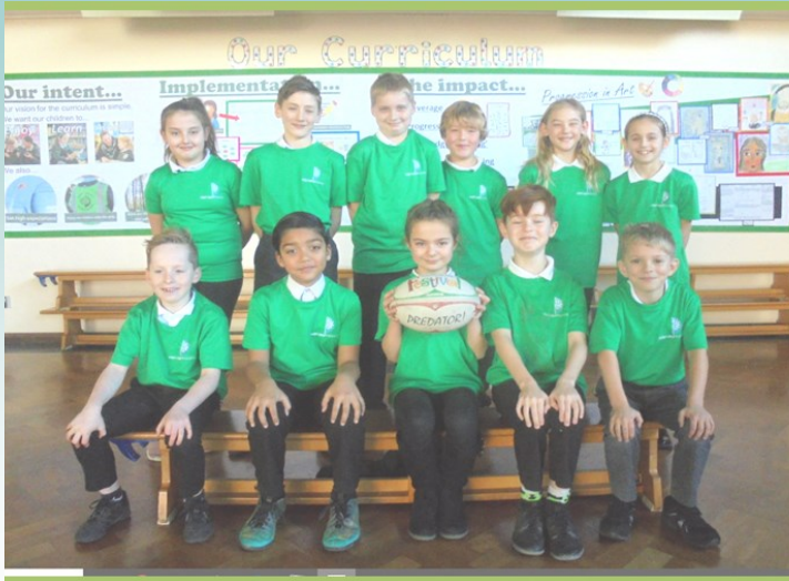
Tag Rugby Team